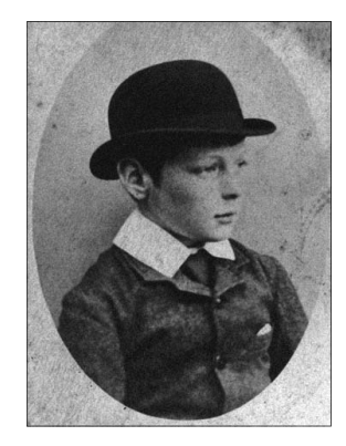
Winston Churchill c. 1884.