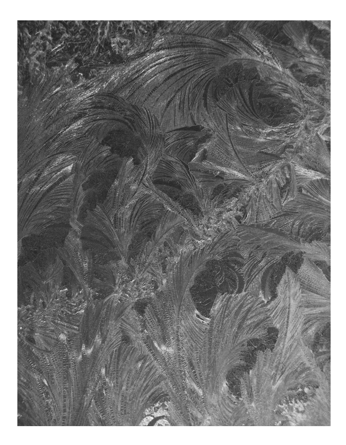
Frost on Window

of trees, fields, etc.? What gives it its depictive content? Approximately this: the visual games in question are ones in which viewers are to see^1 trees and fields. In general, to be a picture of a \phi is to have the function of serving as a prop in visual games in which participants are to see^1 a \phi —they are to see the picture, imagine seeing a \phi and imagine their perceiving of (part of) the picture to be a perceiving of a \phi . This is too simple as it stands; it needs clarification and probably emendation. But it will do for now.