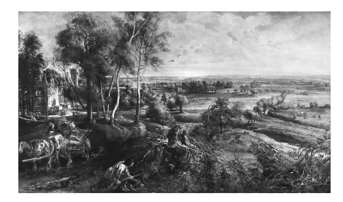
Fig. 1 An Autumn Landscape with a View of Het Steen in the Early Morning Peter Paul Rubens (~1636)

quarry might be, and notice several birds in the field. Examining them more carefully I identify them as partridges. I pick out a blackberry bush in the foreground. Watching the clouds drifting lazily across the sky, I spot a couple of birds circling in the air. Finally I catch sight of a village on the horizon, the town of Malines.