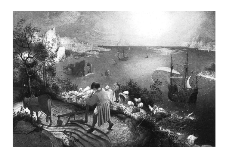
Fig. 3 The Fall of Icarus Pieter Bruegel (~ 1558)