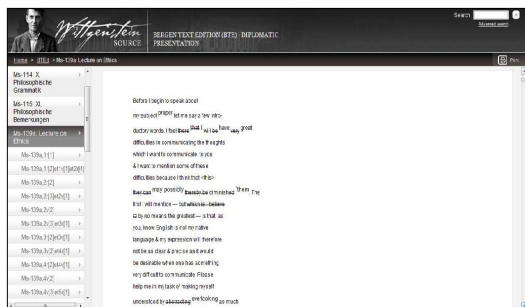
Fig. 1. Screenshot: Wittgenstein Source Bergen Text Edition (Diplomatic version)

These items are rendered in both normalized and diplomatic versions.