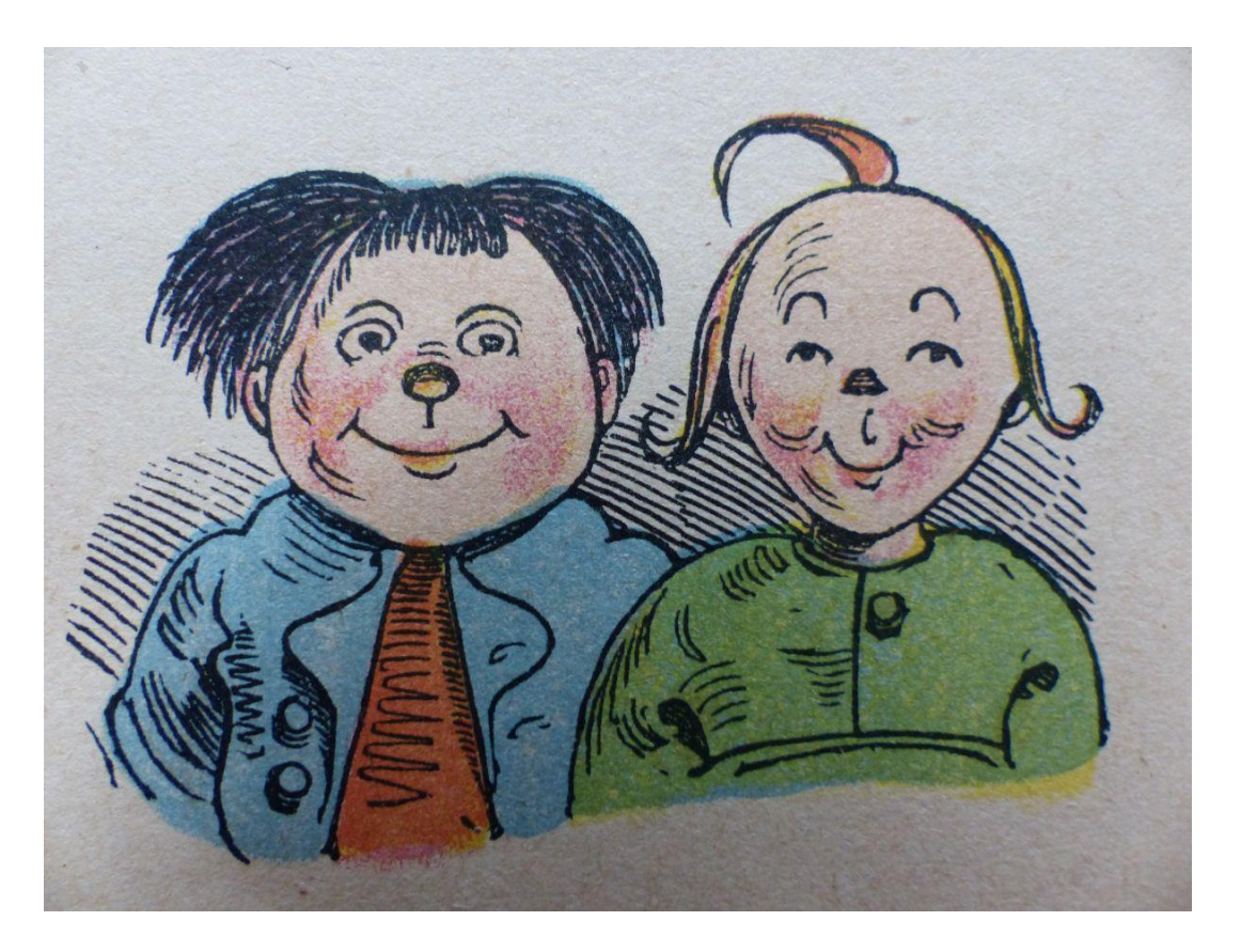
Fig. 4: Max and Moritz. Photo of a drawing on the first page of a copy of Wilhelm Busch's book Max und Moritz. Eine Bubengeschichte in Sieben Streichen. The book originally belonged to von Wright's home library.