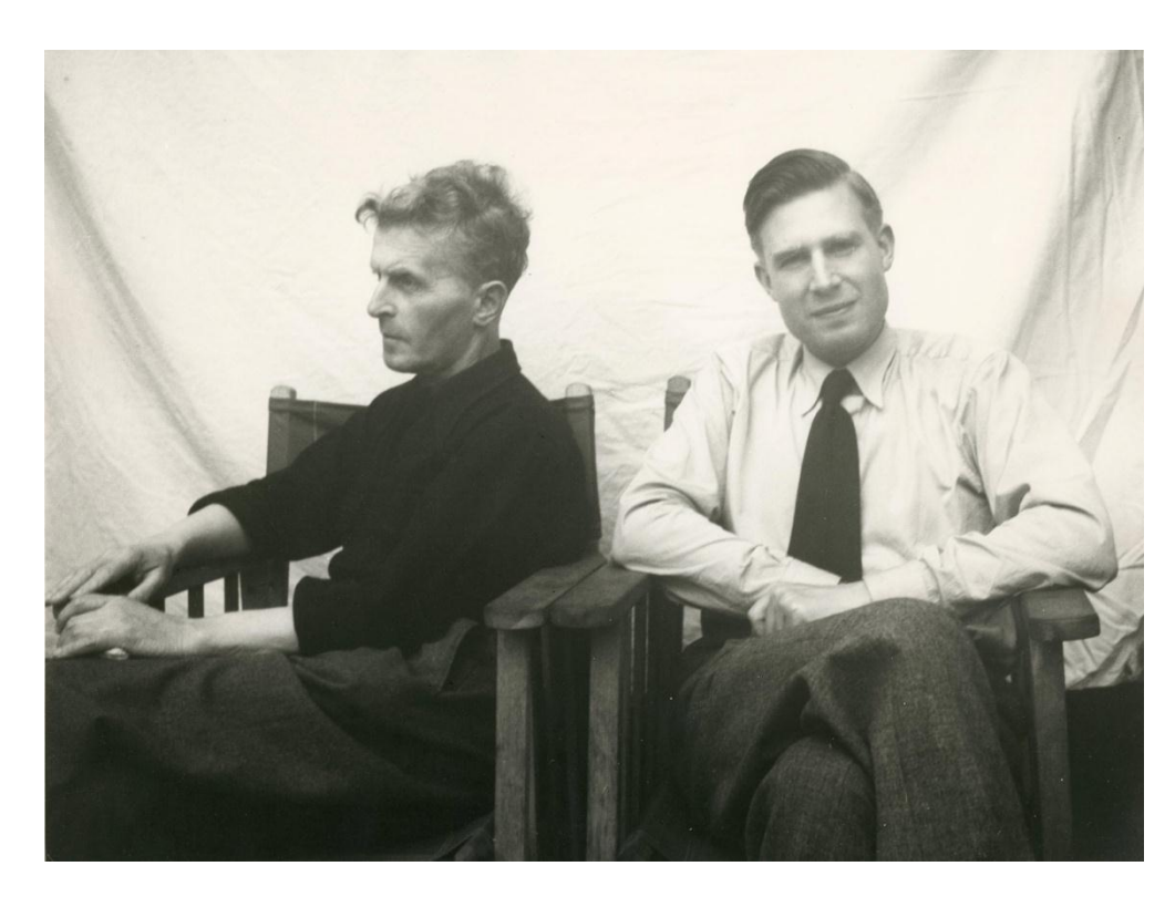
Fig. 3: Wittgenstein and von Wright in Cambridge. Scan of a copy preserved in WWA.