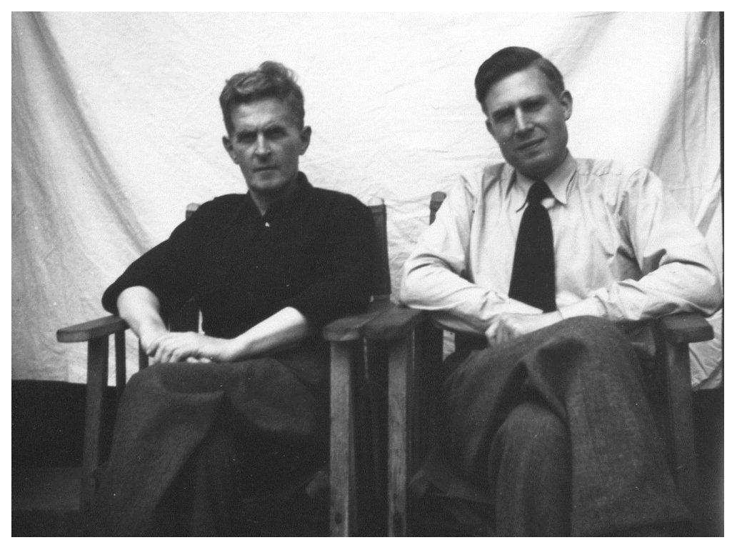
Fig. 2: Wittgenstein and von Wright in Cambridge.